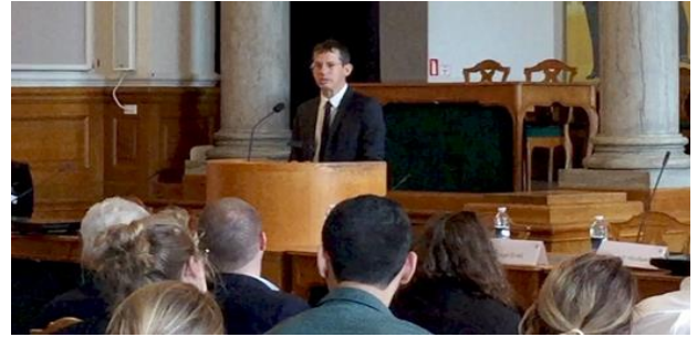
El-Ad at the Danish parliament, Copenhagen, June 9

In April, the New Israel Fund UK and Yachad organized an evening in London reflecting on the 50th anniversary of the occupation with El-Ad and others. The event noted that, now in its 50th year, the occupation has eroded Israel's moral fiber, and throws an increasingly long shadow on the country's international standing. The visit was followed by an interview with El-Ad in the Jewish Chronicle.