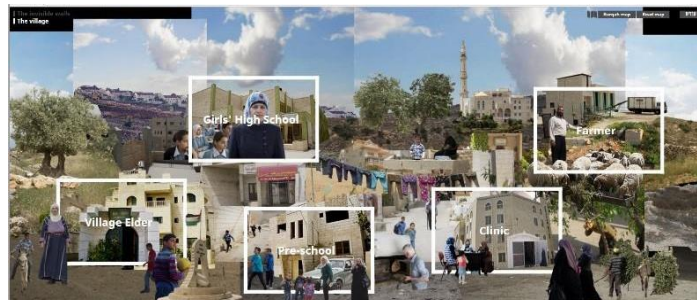
The Invisible Walls of Occupation digital project

In February, B'Tselem launched a digital project called The Invisible Walls of Occupation . The project allows viewers to wander through the Palestinian village of Burqah, meet its inhabitants, and hear them describe their lives and the impact of the occupation via a series of 5 videos: the farmer , pre-school , the village elder , the clinic and the girls school . The project, co-produced with Canadian digital studio Folklore , is based on the B'Tselem report of the same name. The interactive platform, specially developed for the project, creates a