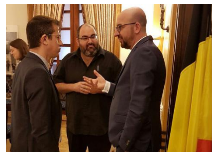
Belgium's Prime Minister Charles Michel speaking with B'Tselem and Breaking the Silence on February 9