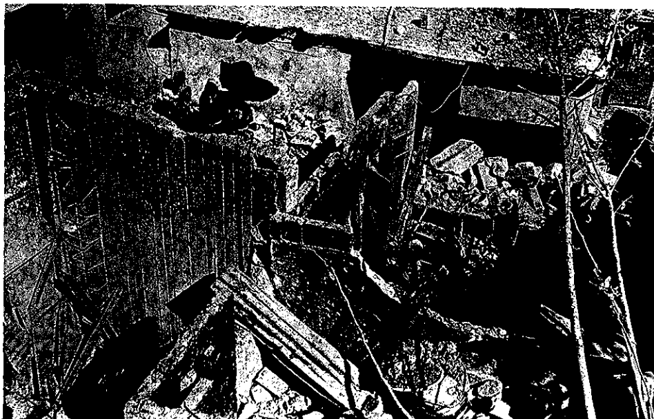
The house near the Karabsa family's house, damaged during the demolition.

The soldiers then tried to demolish the house with a bulldozer, but the bulldozer was unable to maneuver because of the difficult terrain. The house was finally blown up with explosives, causing considerable damage to the neighboring homes. In one house, the tin roof caved in and furniture was damaged. In two other houses, holes were made in the walls, and in two additional houses cracks appeared in the walls.